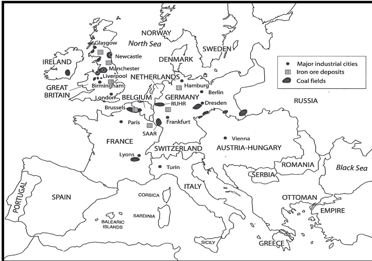
The Spread of Industry—1870